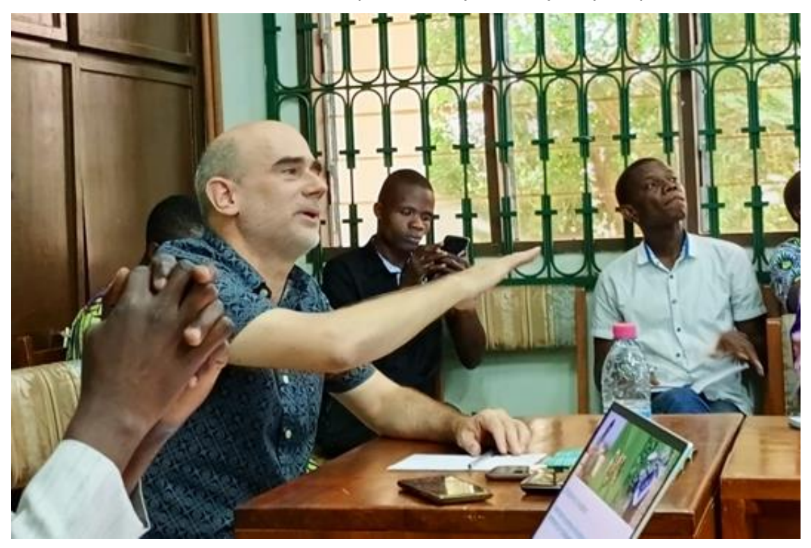
Presentation of the JRS Biodiversity Foundation by the ED

The talks were followed by a question-and-answer session, notably on the types of projects funded, the criteria for applicants, the application timeline, and much more, allowing participants to find out more about the foundation.