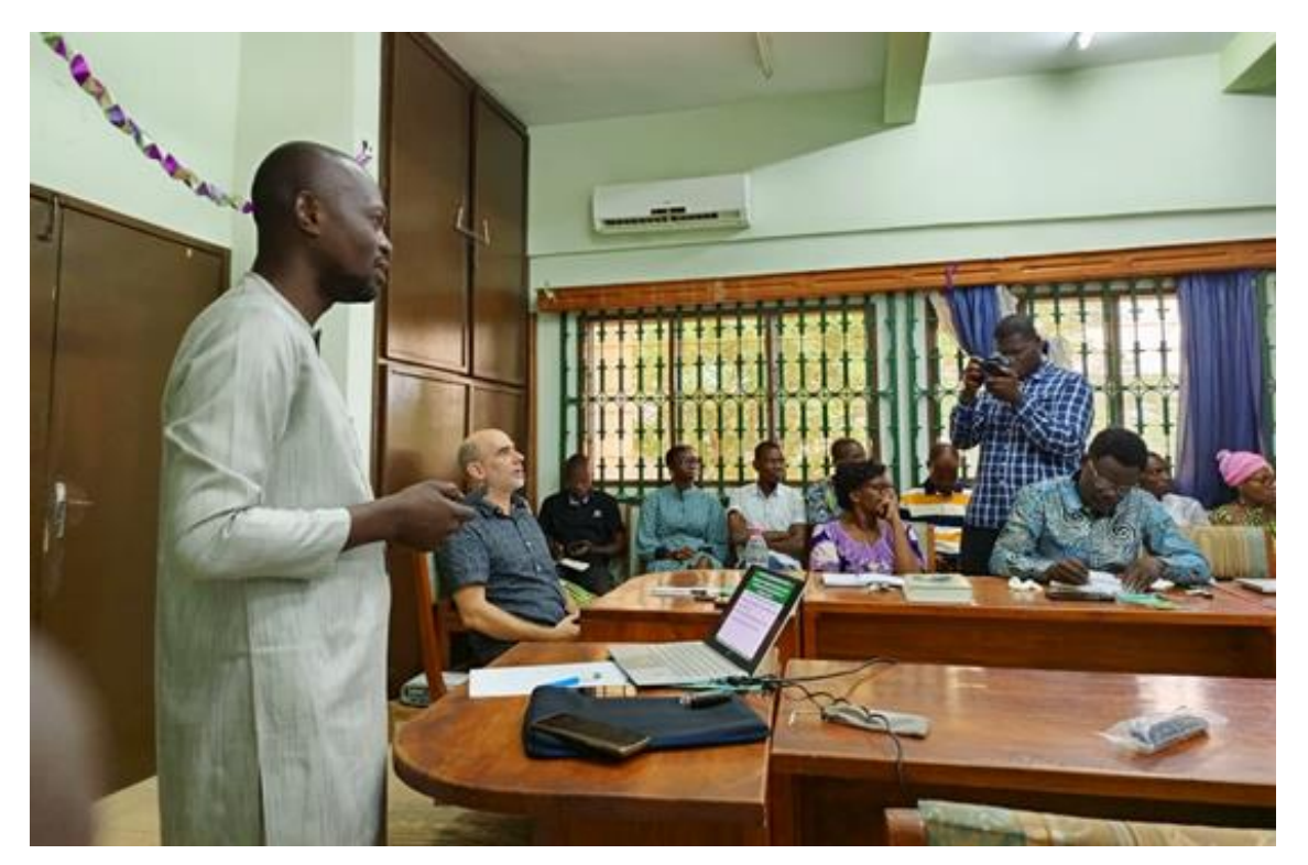
Presentation of the initial report of the BryoBen Project by Hospice

Activity 1: Presentation of the initial report of the BryoBen Project by the PI and presentation of the JRS Biodiversity Foundation by the ED